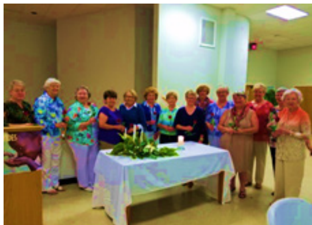
Past President and Moderators of Laurinburg Presbyterian Women