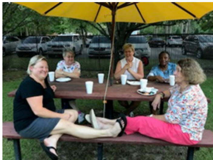
LADIES HARD AT WORK, UMHUM