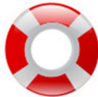
DON'T FORGET THE LIFE SAVER