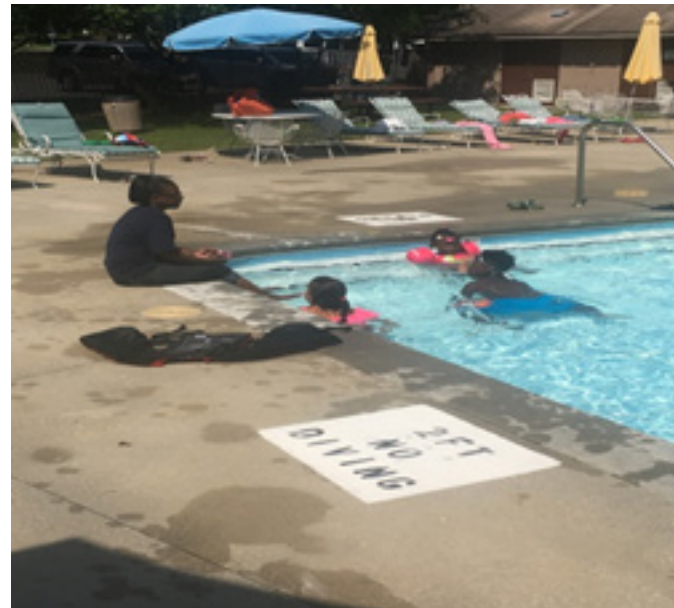
WHAT DO WE NEED TO DO COACH?